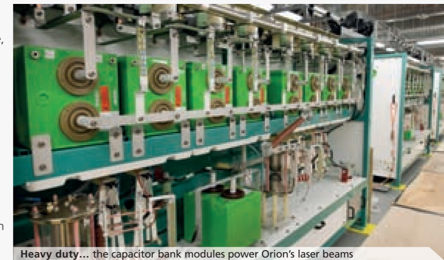
Heavy duty... the capacitor bank modules power Orion's laser beams