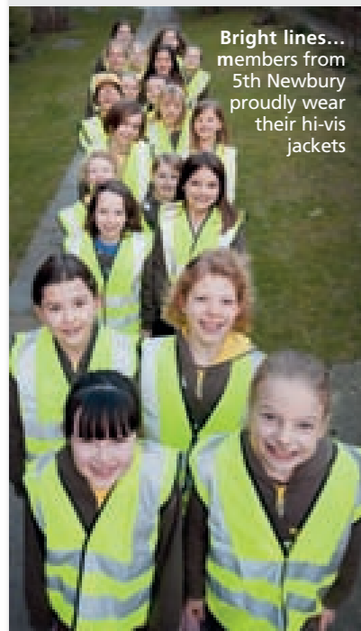
Bright lines... members from 5th Newbury proudly wear their hi-vis jackets