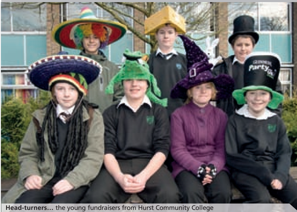
Head-turners... the young fundraisers from Hurst Community College