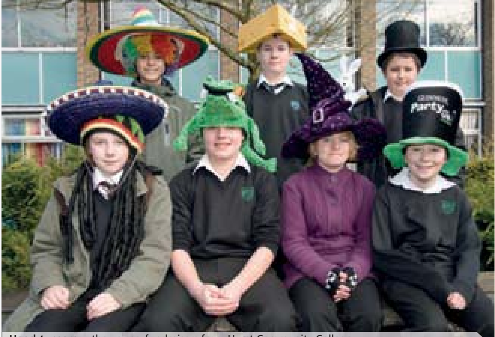
Head-turners... the young fundraisers from Hurst Community College