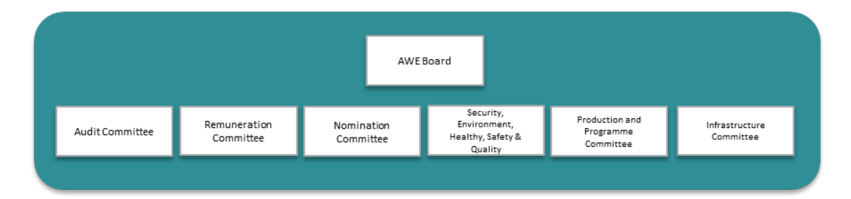
Figure 3: Key Governance Forums

AWE will have a Board which will operate in line with good standards of corporate governance and in particular the Financial Reporting Council's UK Corporate Governance Code<sup>7</sup>. Figure 3 sets out the Key Governance Forums, including composition, of AWE, and Table 2 sets out the key responsibilities for each role. Further detail on roles can be found at Annex A and full details of sub-committees can be found at Annex B.